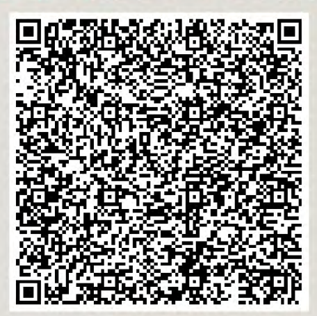
Scan the code to apply For more information contact: