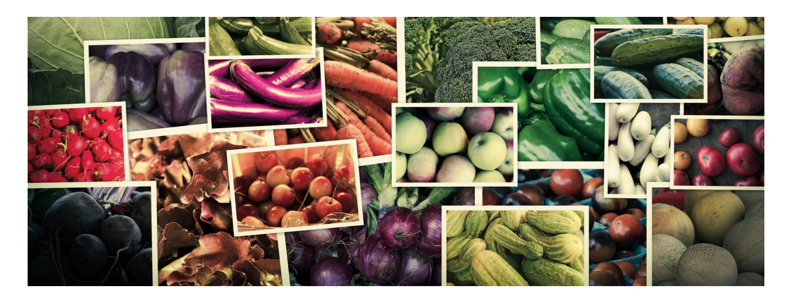
Tim Woods, Emily Spencer, and Matt Ernst

Summary Prices for many crop inputs have increased steadily since 2016. This report updates 2023 Kentucky price trends for key vegetable and fruit crop inputs: fuel and fertilizer, labor, plant protection products, and seed. These representative data may be used to help producers identify input costs and trends and update production budget estimates for 2024. Nationally, there has been a sharp increase in many farm inputs connected with the vegetable sector, especially over the past 3 years.