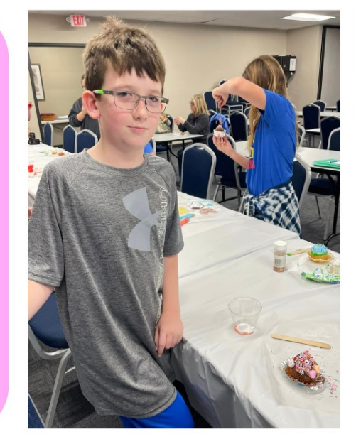
The LaRue County 4-H Cooking Club will meet on Wednesday, March 6th from 4:00-5:30pm at the LaRue County Extension Office