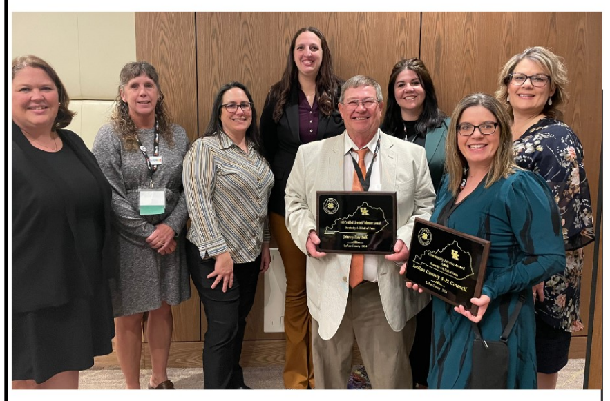
The LaRue County 4-H Council Fair Committee was recognized with the Community Service Award. This was for their work on the LaRue County Fair and the Kids Day over the past several years.